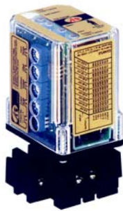
API 4059 G M02

Solution: API furnished the customer an API 4059 G M02. The API 4059 G M02 provides the excitation power to the melt pressure transducer and is fully field range able for the excitation supply, sensitivity (output from the transducer) and DC current output. The API 4059 G M02 uses state-of-the-art optical isolation, has NON-INTERACTIVE zero and span controls and has 20 V compliance (capable of driving 20 mA into 1000 ohms) so the output signal can be looped thru both the panel meter for local display and the PLC for control and recording. An added feature of the API 4059 G M02 is that it utilizes the pressure transducer's internal calibration resistor to unbalance the bridge to a specified value (typically 80% of full scale) when the functional test switch is in the CAL position, ensuring accurate system calibration.